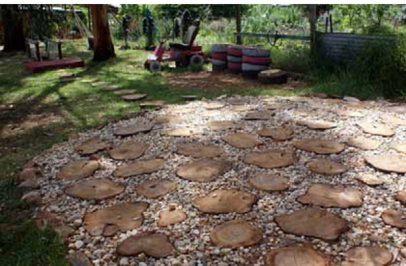
The New Playground

Two new facilities are being developed – the Playground and the Music Cubby – and they are already proving popular with children especially at the major ECOSS events. Generous funding