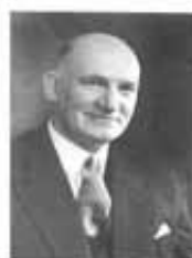
THE HUGH WILLIAMSON FOUNDATION