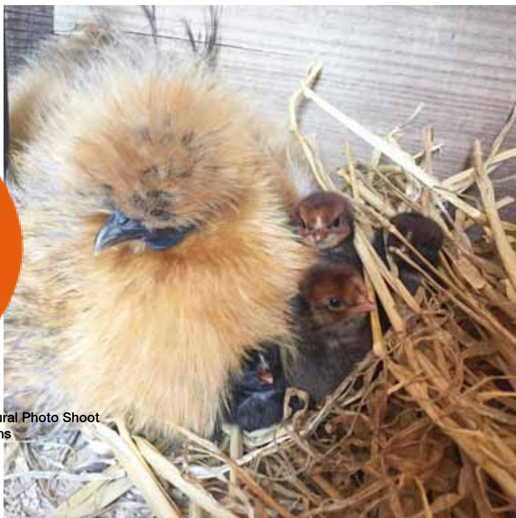
Front Cover Photo: Ecotopia Multicultural Photo Shoot Above Photo: ECOSS Hen and Chickens