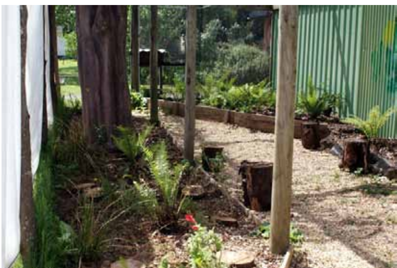
Gondwana Rainforest Sensory Space